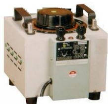
2A to 15A with output post terminals Aust Input AC lead and plug

Single Phase - (P) Portable / Bench Top - Air Cooled - Manual