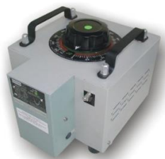
20A to 28A